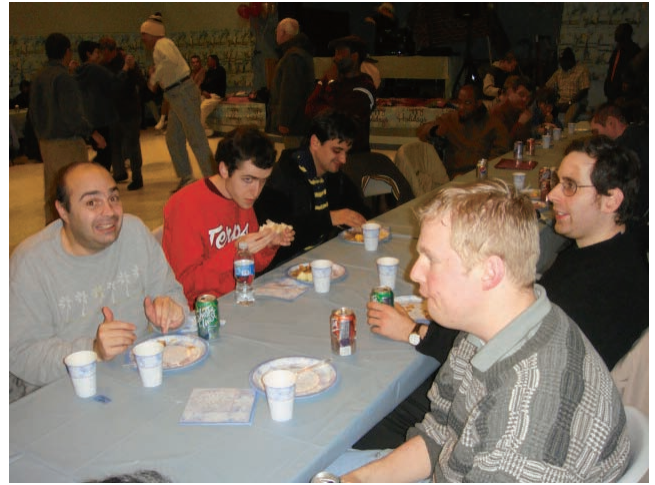
Earthstar and Kings Farm residents enjoy snacks and music together.