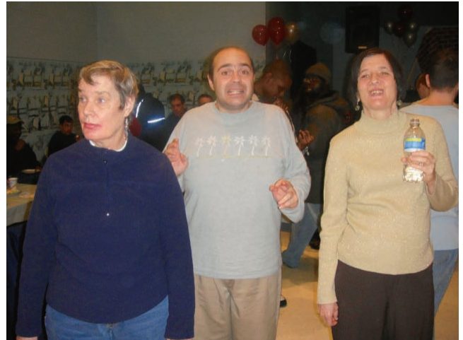
Everyone was on the dance floor.